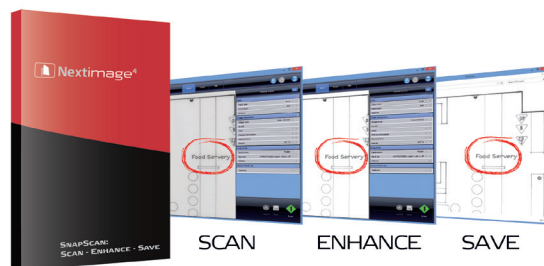
Optional Nextimage Scan+Archive More file formats and improved image controls.